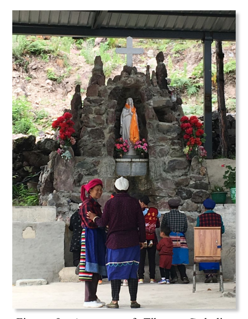
Figure 9. A group of Tibetan Catholic women are kneeling in front of a marble statue of Virgin Mary, praying for rain, birth and health.

societies.<sup>97</sup> Sociologically, the Marian cult is able to solve some of the spiritual and institutional impasse caused by the external tumultuous circumstances. Chinese Catholics have been raised on catechesis that stresses the importance of receiving the sacraments for achieving salvation.<sup>98</sup> However, a scarcity of priests has always been a problem for the Chinese Catholics, especially during the Cultural Revolution. Without priests or proper institutions, omen, usually the Catholic nuns, mothers and