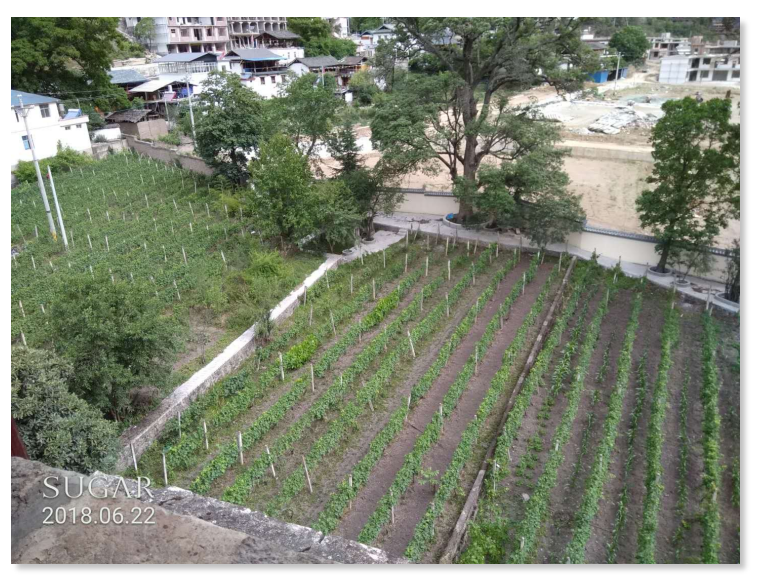
Figure 14. Vineyards outside of the Cizhong Cathedral which used to be belonged to the Church, are being managed by the local Buddhists.

Not only is the church's land legally controversial, the vineyards used to be owned by the Church is also under a dispute. During the Cultural Revolution, acres of vineyards owned by the Church of Cizhong were taken and incorporated into the state's property and