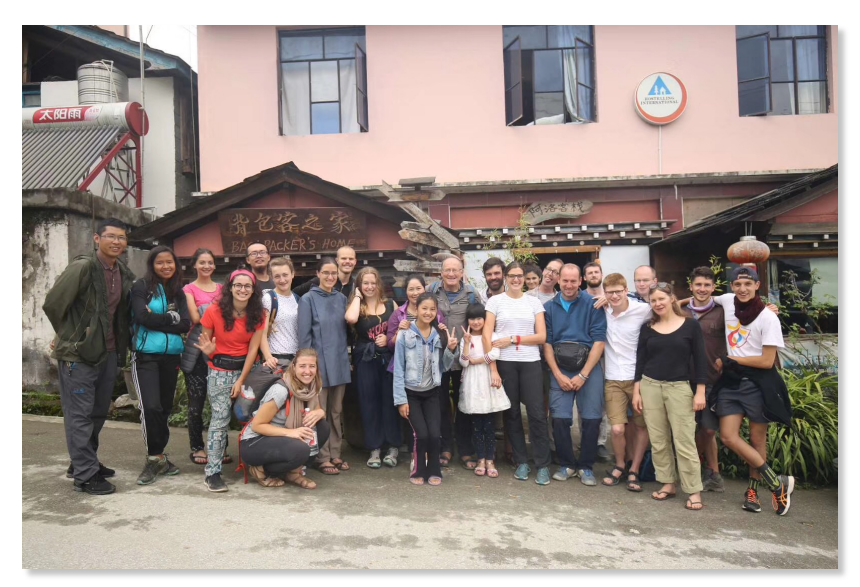
Figure 19. A group of Catholic pilgrims from France and Switzerland.

Catholicism as one of the oldest and the most internationally and historically connected denominations, has made Luosai and other Tibetan Catholics situate themselves in the global and historical Catholic communities even though they may not even know where the Pope resides.