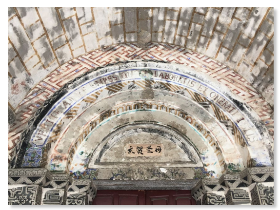
Figure 2. The circular pediment of the Cizhong Cathedral (英中天主堂) on which Matthew 11: 28 is written in Latin: "Venite ad me, omnes, qui laboratis et onerati estis." (Come unto me, all ye that labor and are heavy laden.)

Living in a multi-religious and ethnic environment, Tibetan Catholics are in a state of a sporadic conflict between two or more religions, and there has been interesting evidence indicating that they are actually syncretizing various religious ideologies into an idiosyncratic way of expression to comprehend the reality — syncretism. <sup>70</sup>