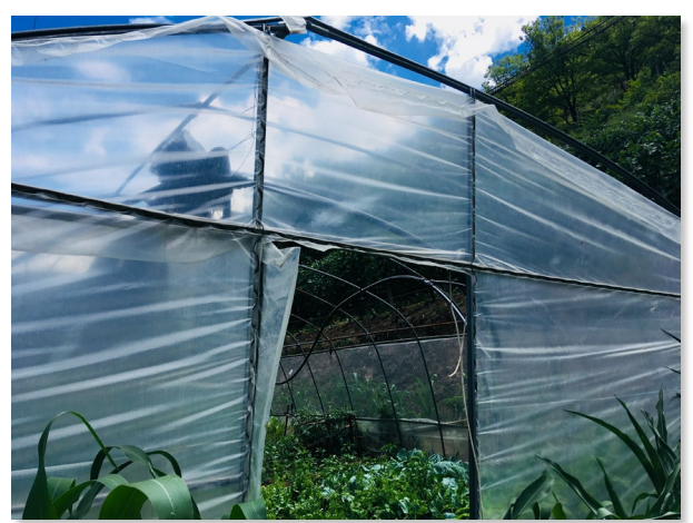
Figure 16. The greenhouse built by the state and was given to Alysa who has planted all sorts of plants as she likes.