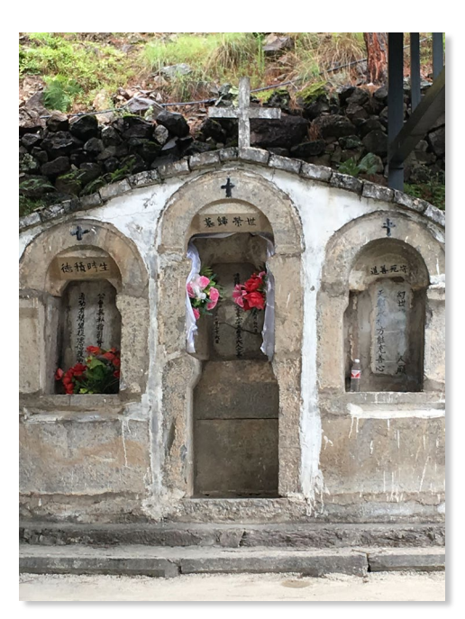
Figure 11. The other grave for the martyred missionaries.

the missionaries, the Marian cult has received a universal acceptance by the Chinese recipients who usually favor Mary over God and Jesus. This interesting phenomenon has directed the development of Christianity in China, incorporated various native religious and cultural aspects into Christianity, and eventually indigenized Western Christianity into a distinctive offshoot with Chinese characteristics.