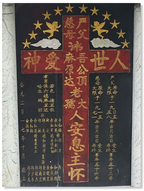
Figure 5. A stele on which names of the buried and the family members are inscribed.

and progenitors, are all inscribed on it, inferring that the buried shall be blessed by God on behalf of the family as a whole. In Figure 4. besides the cross on the top representing Catholicism, there are reliefs of Daoist deities on two sides, of Chinese dragons, and of kylins , a traditional Chinese mythological creature. In Figure 5. two cherubim are painted above the cross. On the right side of the cross, the names of the buried are listed, and the