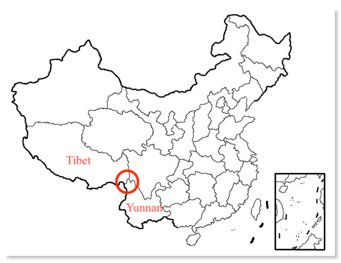
Map 1. China: Tibet and Yunnan. NB: the field research was conducted in the circled area.

treasure. Impressed by a feeling of sacredness and the Father's preaching against the encroaching materialism, I started to wonder: while Catholicism is gradually dying in the West, what keeps these non-Westerners worshipping a "Western God" in a Buddhists' territory? How