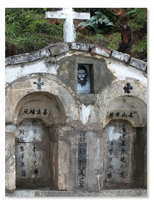
Figure 10. One grave for the martyred missionaries.

Even though the Marian cult usually is not as important as the notions of God and Jesus Christ in the traditional Western Catholicism. However, having been brought to China by