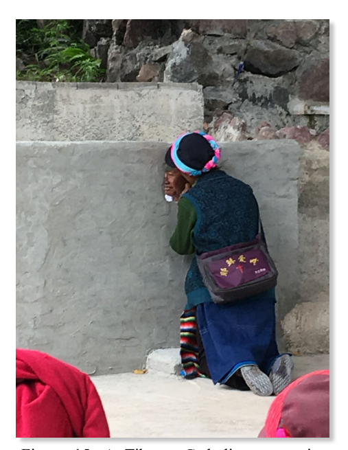
Figure 15. A Tibetan Catholic woman is confessing to the Father through the window on the stone wall.

"But the child's attitude to its father is colored by a peculiar ambivalence. The father himself constitutes a danger for the child, perhaps because of its earlier relation to its mother. Thus it fears him no less than it longs for him and admires him. The indications of this ambivalence in the attitude to the father are deeply imprinted in every religion." <sup>143</sup>