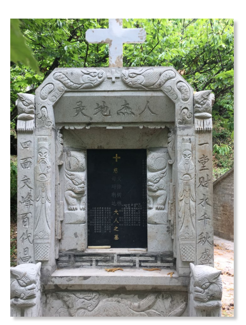
Figure 4. A Tibetan Catholic gravestone.

Besides the cathedral's decor styled in a Western and Eastern fusion, Tibetan Catholicism emphasizes family lineage in a syncretic fashion as well. In terms of family lineage, Chinese Catholicism has been built upon a concrete sense of continuity from the Biblical patriarchs to their own familial ancestors to contemporary Chinese Catholics themselves. Chinese Catholics substantiate the abstract idea of the Biblical lineage to a realistic blood tie connecting themselves to these Israelite prophets, which gives them a sense of security and historicity. This deeply integrated concept of a continuum of family lineage has been assimilated by Chinese especially rural residents through traditional