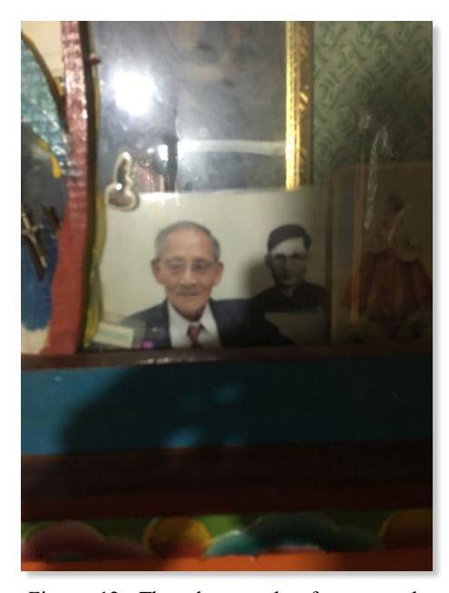
Figure 12. The photograph of a revered Father.

This notion of believing the dead still exists with us is a traditional Chinese folk religious idea which is popularly practiced especially towards deceased family members. Historically, every Chinese family had an ancestral altar on which there were a number of wooden tablets with the ancestors' names on them. A series of religious rituals were performed to commemorate them, indicating that they still occupied a place in this household. In the contemporary Chinese family, similar rituals are still being conducted in a much simpler fashion, but this idea of visioning the dead has been kept. This idiosyncratic spirituality demonstrates the adaptability and indigenization of Tibetan Catholicism.