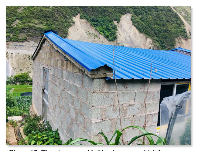
Figure 17. The pigsty provided by the state, which has never been used. Photography by Shuyan Huang.

Catholic communities' normal socio-economic life.